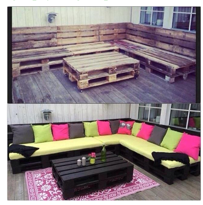
Check their pages for more ideas!

See more photos from events and learn more about area "green" efforts by becoming a fan of our \frac{\text{Facebook}}{\text{Page}}